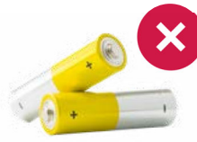
Batteries & Electronics