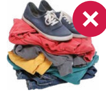
Clothes & Shoes